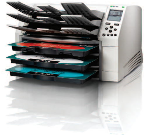
A, A4 Color Paper